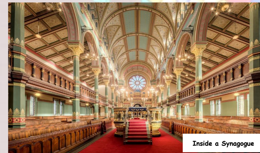
Inside a Synagogue