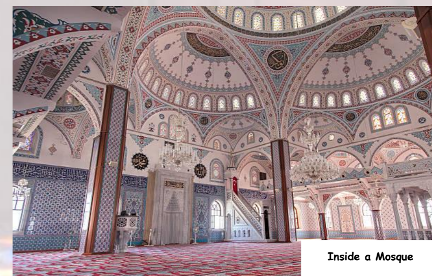
Inside a Mosque