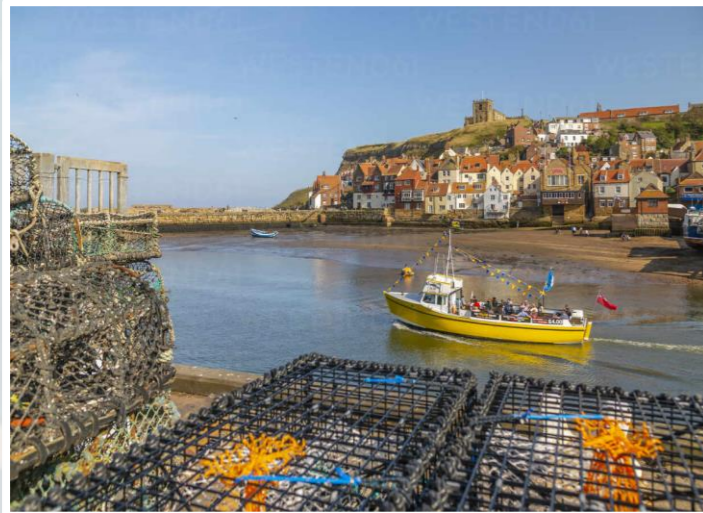
Boats at the mouth of the River Esk