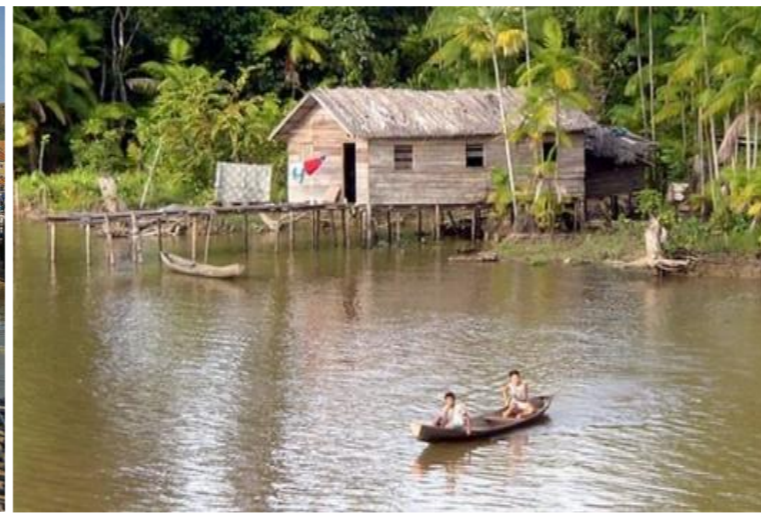
Boats on the Amazon River