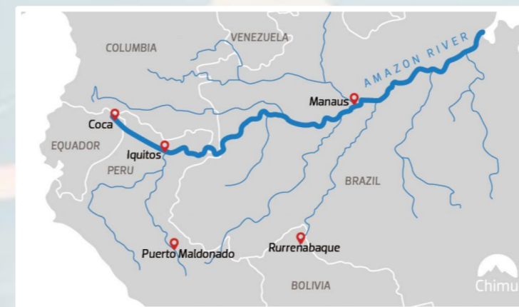
The Amazon River